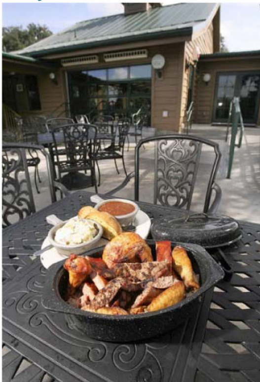
Route 46.